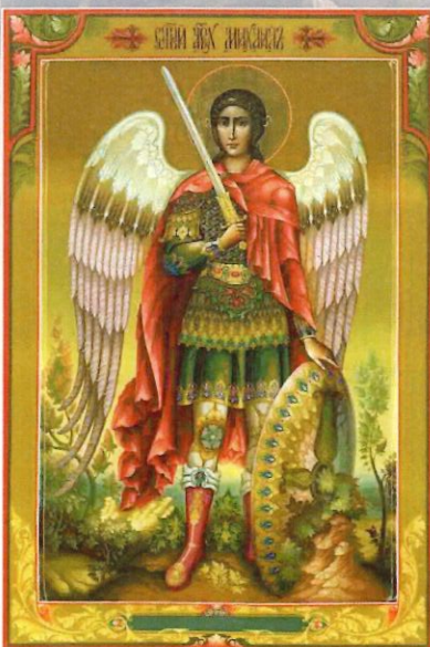
Saint Michael, Pray for us.

Open to all Veterans, First responders, and Active and Reserve Military.