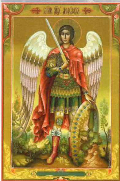
Saint Michael, Pray for us.

Open to all Veterans, First responders, and Active and Reserve Military.