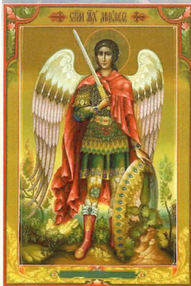
Saint Michael, Pray for us.

Open to all Veterans, First responders, and Active and Reserve Military.