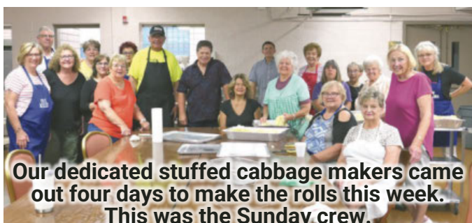
Our dedicated stuffed cabbage makers came out four days to make the rolls this week. This was the Sunday crew.